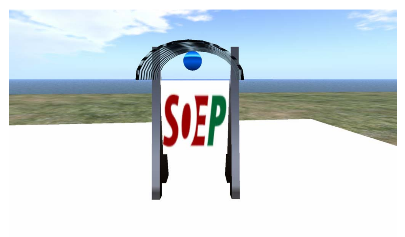
Figure 2 – A "Survey Kiosk"