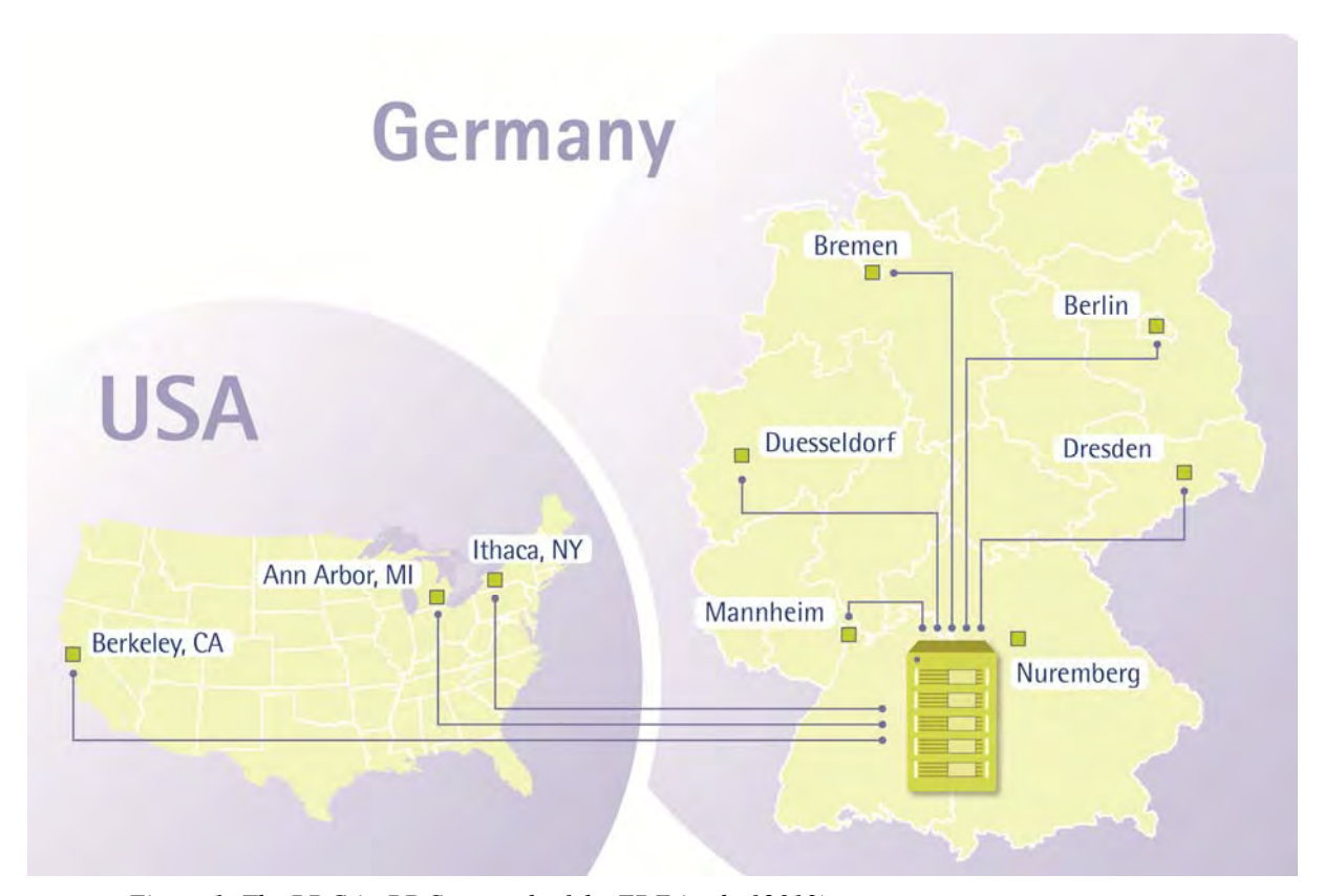
Figure 1: The RDC-in-RDC network of the FDZ (end of 2013)

cares for physical access control to a secure room, so that only researchers with a valid contract are able to access the facility. In addition the guest-RDC staff monitors the researcher in the secure room and makes sure that nothing prohibited happens. The secure room is a separated room only made for accessing confidential data. It is only equipped with devices to access the distant data sources; no access to any additional sources of information is possible. From the secure room within the guest-RDC a secured and encrypted connection through the internet to the secured servers behind the firewalls of the data-RDC is opened. Within this secure remote desktop approach, researchers access the secured servers of the data holder from the guest-RDC and can work with the confidential research data (browse, modify, run calculations, get output). The microdata always stay on the secured servers and only a live stream of the used graphical user interface is transferred to the device (screen) of the user.